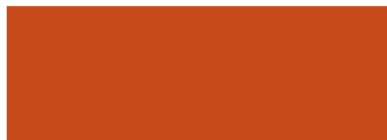
RAL2001 Red orange