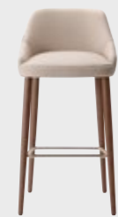
ADIMA 07 H 102 P 53 H 56 H 75 1 m³ 0,41