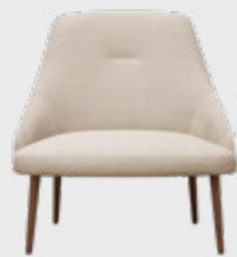
ADIMA 05 XL H 89 P 80 H 80 H 42 1 m³ 0,72