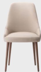
ADIMA 01 H 91 P 51 H 58 H 48 1 m³ 0,37