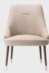
ADIMA 05 H 89 P 64 H 76 H 42 1 m³ 0,51