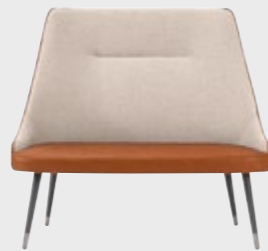
ADIMA 09 HB H 120 P 125 H 79 H 42 1 m³ 1,6