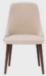
ADIMA 00 H 85 P 50 H 56 H 47 1 m³ 0,37