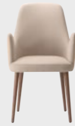
ADIMA 04 H 91 P 52 H 58 H 48 H 69 1 m³ 0,37