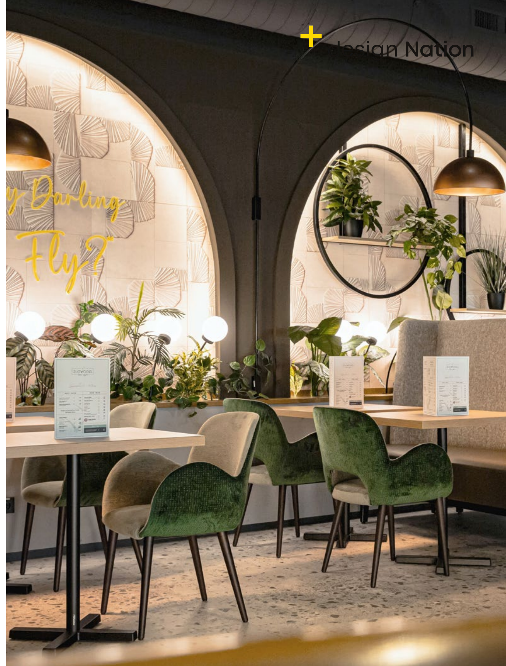
Project: Zugvogel Restaurant, Vienna airport, Vienna, Austria. Interior Design: Derenko Innenarchitektur.