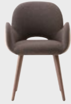
BLISS 02 H 81 P 54 H 58 H 46 H 66 1 m³ 0,38