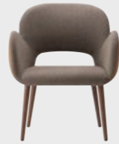
BLISS 05 H 83 P 74 H 72 H 45 H 68 1 m³ 0,52