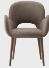
BLISS 04 H 85 P 59 H 61 H 46 H 69 1 m³ 0,38