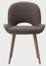
BLISS 01 H 80 P 57 H 56 H 46 1 m³ 0,31