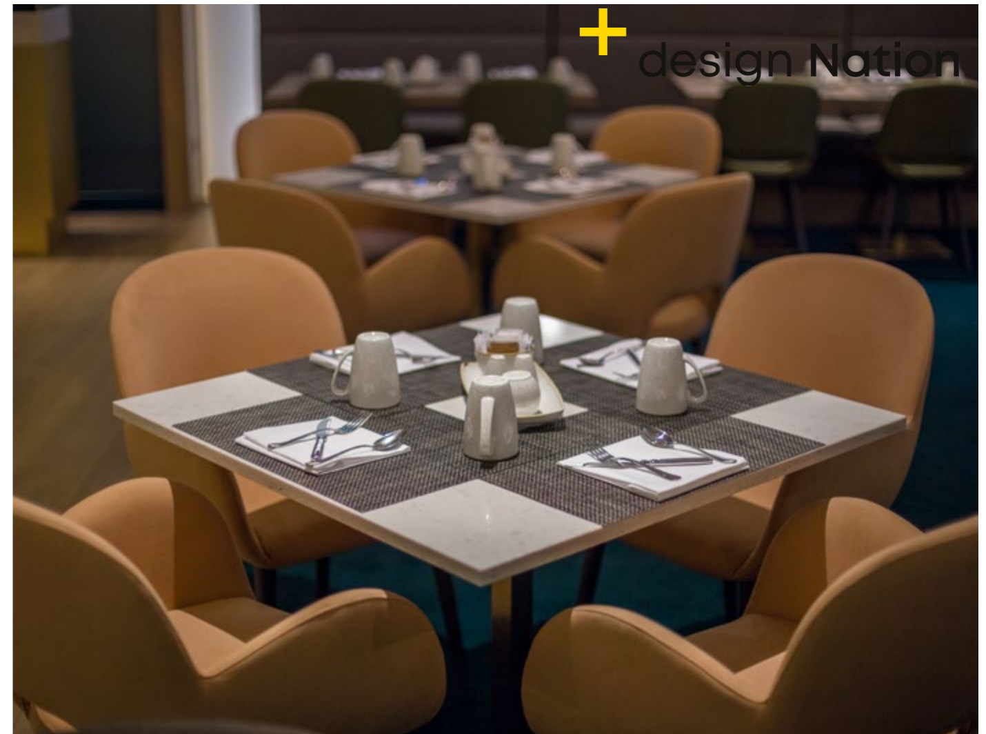
ON THE RIGHT. Project: Radisson Hotel, Bucharest, Romania. Interior Design: Creneau International.