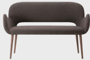
BLISS 09 H 80 P 127 H 61 H 46 H 65 1 m³ 0,73