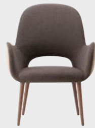
BLISS 05 HB H 98 P 74 H 72 H 45 H 68 1 m³ 0,64