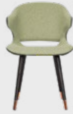
MARGOT 04 H 83 P 60 H 59 H 47 1 m³ 0,38