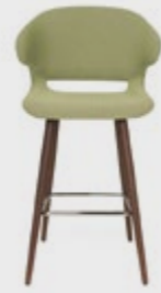
MARGOT 07 H 115 P 59 H 62 H 76 1 m³ 0,48