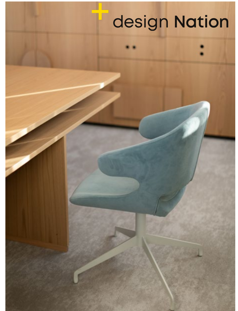
ON THE RIGHT. Project: Chiurlo Multifunctional Representative Space, Campoformido, Italy. Interior Design: Visual Display.