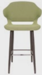
MARGOT 07 XL H 120 P 68 H 67 H 76 1 m³ 0,65