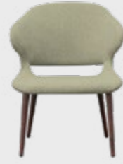
MARGOT 05 H 86 P 68 H 67 H 42 1 m³ 0,52