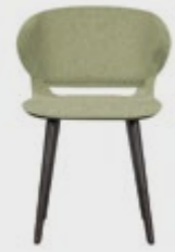
MARGOT 02 H 80 P 55 H 59 H 47 1 m³ 0,31