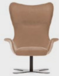
NIRVANA BERGERE H 115 H 90 H 94 H 43 1 m³ 1,08