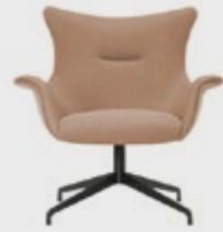
NIRVANA 05 H 84 H 90 H 93 H 42 1 m³ 0,75